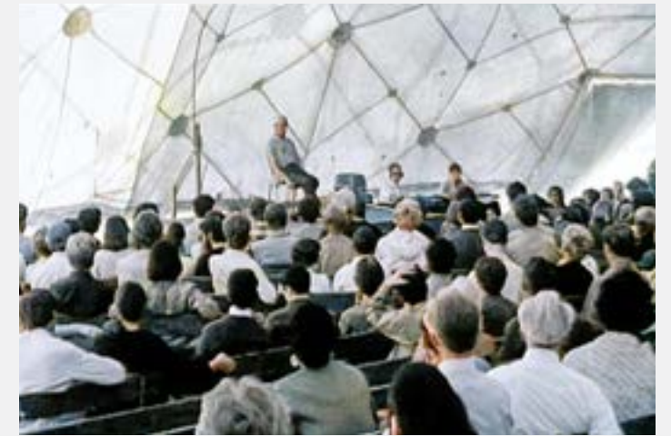
For more information visit kfa.org/gathering

Join us for the KFA Annual May Gathering at Oak Grove School in Ojai. This gathering is an opportunity for people from all over the world to come together and listen to engaging speakers, participate in meaningful discussions, attend workshops, and take in the natural beauty of our campus. Choose from different programs on topics such as consciousness and education, or engage with teachers from our schools and scholars of Krishnamurti's teachings who share their understanding. This gathering will also be streamed live through our website.